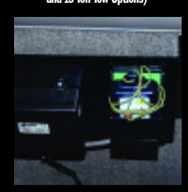
Wireless Remote for Optional Winch/Buzz Box Holder (Buzzer Goes Off When Out of Holder)